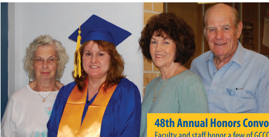
48th Annual Honors Convocation Faculty and staff honor a few of GCCC's finest students with special recognition awards.